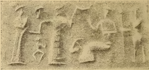
The Little White Seal of the King of the East.